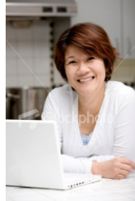
Photo that appears in: Good quality health care: What it is and why you can't take it for granted

Image #: 3005288 Size: Medium File size: 1.91 MB Changes: Cropped to remove some background