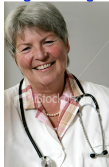
Photo that appears in: Information about health care quality: What it is and where to find it

Image #: 864008 Size: Medium File size: 1.73 MB Changes: None