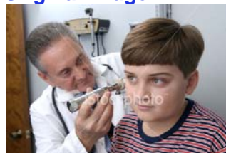
Image #: 3924960 Size: Medium File size: 1.77 MB Changes: Cropped slightly