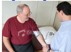
Image #: 5268281 Size: Medium File size: 2.25 MB Changes: Cropped to focus on face