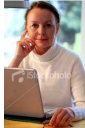
Image #: 5026088 Size: Medium File size: 1.59 MB Changes: Cropped to focus on faces