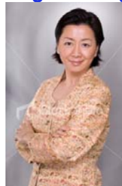
Image #: 3764295 Size: Medium File size: 1.26 MB Changes: Cropped to focus on face